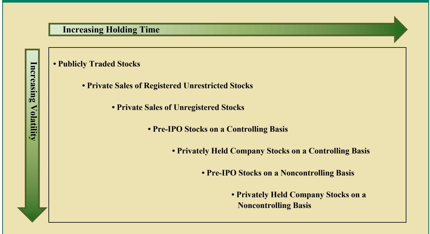
Exhibit 4 Stock Sales

In order to analyze the reasonableness of the Chaffe model output, this discussion compares the