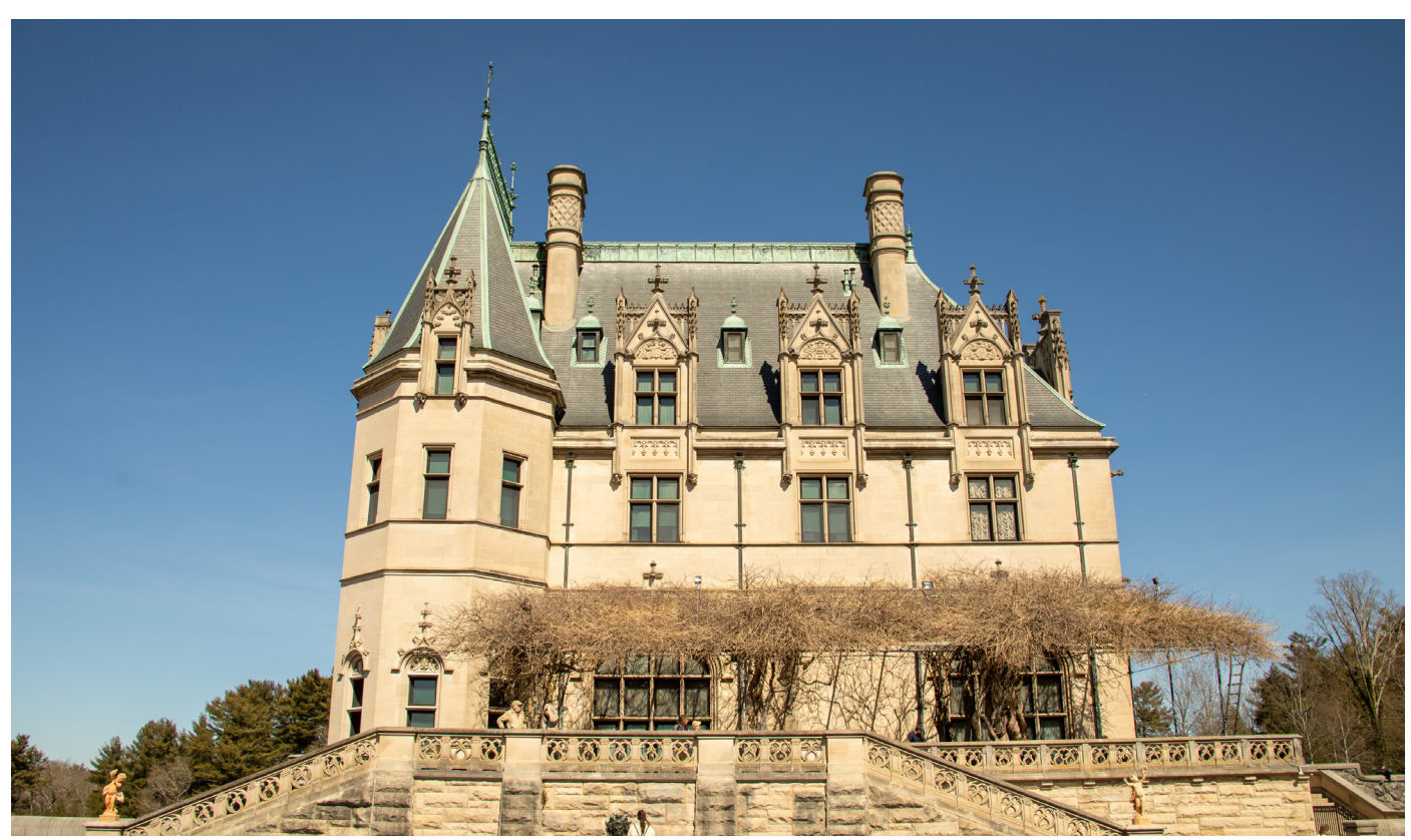
The Biltmore House in Asheville, North Carolina, is the foundation of the Biltmore Company. A valuation of the Biltmore Company led to a dispute that was settled in February 2023 in U.S. Tax Court.